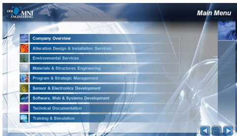
Corporate Touchscreen Interface

Client: Naval Surface Warfare Center, Carderock Division