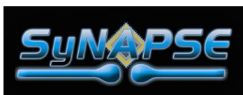
SyNAPSE Program Logo Client: DARPA Defense Sciences Office