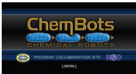
ChemBots Program Collaboration Site Interface