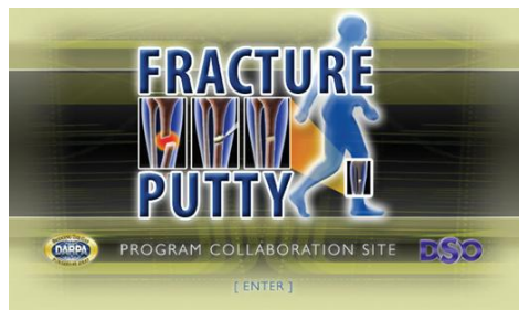
Fracture Putty Program Collaboration Site Interface