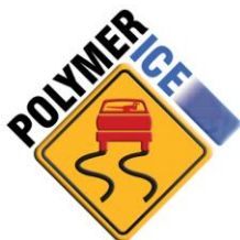
Polymer Ice Program Logo Client: DARPA Defense Sciences Office