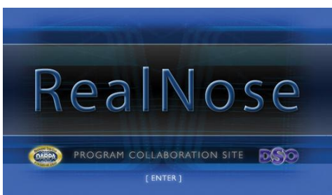
RealNose Program Collaboration Site Interface